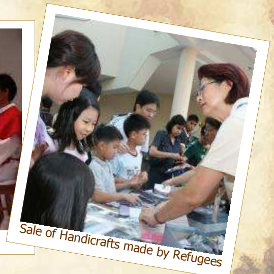
Sale of Handicrafts made by Refugees