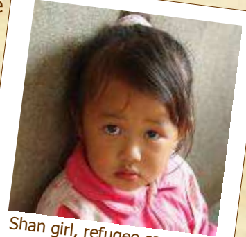
Shan girl, refugee camp at the Thai-Burmese border

In those dark years, the UN and other organizations did great work helping these people to go home. To ensure that countries would respect the rights of refugees, the 1951 Refugee Convention was created and signed by more than 100 states.