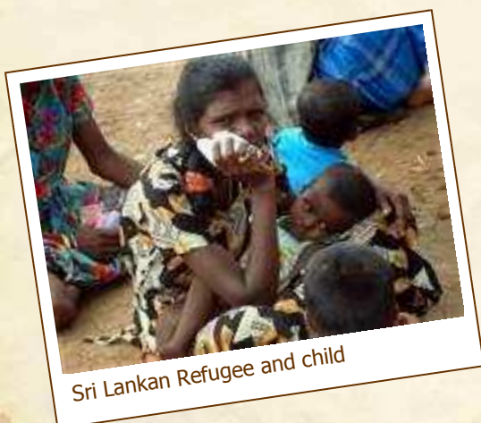
Sri Lankan Refugee and child

You can read about their experiences in the forthcoming issues of Refugee Voice.