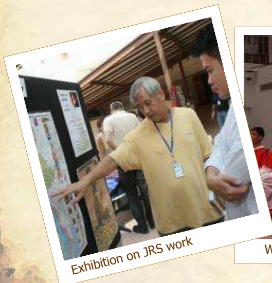
Exhibition on JRS work

Let's not get mired in the numbers – 140,000, 5 million, 40 million, etcetera. These numbers highlight the enormity of the refugee problem. But let us not forget the unique individuals with their own hopes and dreams, fears and challenges behind each of these numbers. So join us this World Refugee Day as we work with refugees, one face at a time.